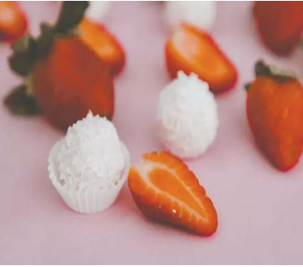
Over a period of 12 weeks, the participants were asked to abstain from berry fruit consumption of any kind except for a daily packet of supplement powder to be